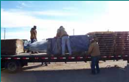
Delivery of Supplies