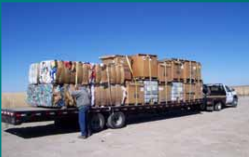
Pickup of Materials