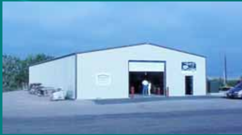
Cheyenne County - 2002