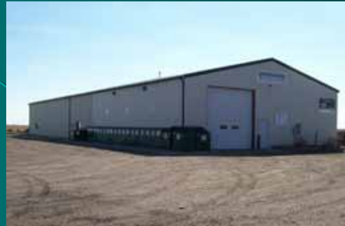
Regional Facility Thomas County - 2002