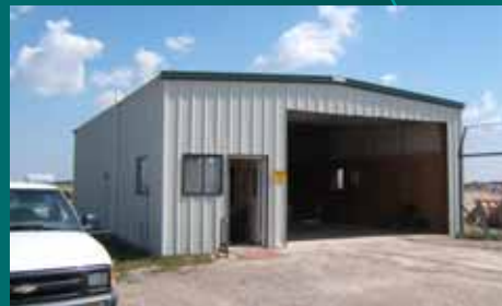
Logan County - 2002