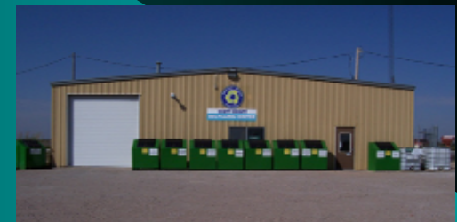
Scott County - 2008