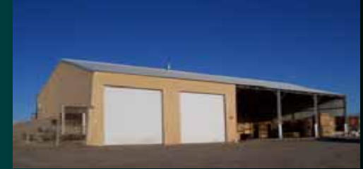
Sheridan County - 2006