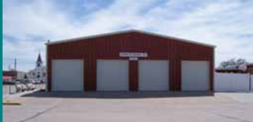
Rawlins County - 2003