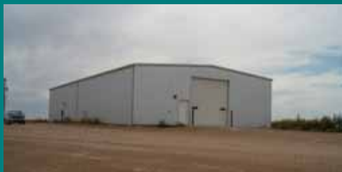
Gove County - 2002