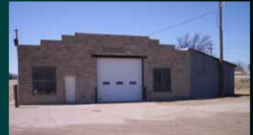
Decatur County - 2005