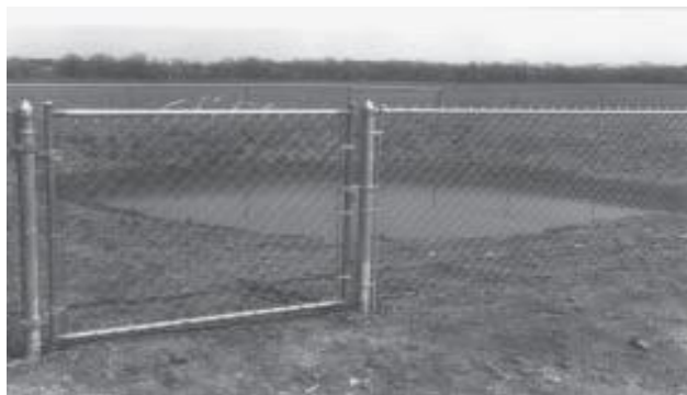
Figure 4. A well-constructed new wastewater pond — this chain-link fence will have a long life and requires little maintenance.

The sewer line trench bottom should be undisturbed soil and free of rocks that could break the line. Backfill and compact around the sides and over the pipe until two inches of fill cover the pipe. Compact the remainder of the trench fill in six-inch layers. Finally mound over the trench about six inches to allow for settling of the trench fill.