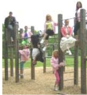
Healthy students are better students

The contest began as soon as schools were in session and essays should be submitted by September 21. School nurses should enlist teachers to announce the contest in class. For more details