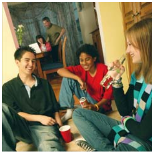
One-third of teens say that it is easy to get alcohol from their own parents.

The American Medical Association's (AMA) "Teenage Drinking Key Findings" fact sheet presents data from two national surveys on how adolescents obtain alcohol. Both surveys were conducted in spring 2005 and were funded as part of the AMA's partnership with the Robert Wood Johnson Foundation. The first survey, conducted by Teenage Research Unlimited,