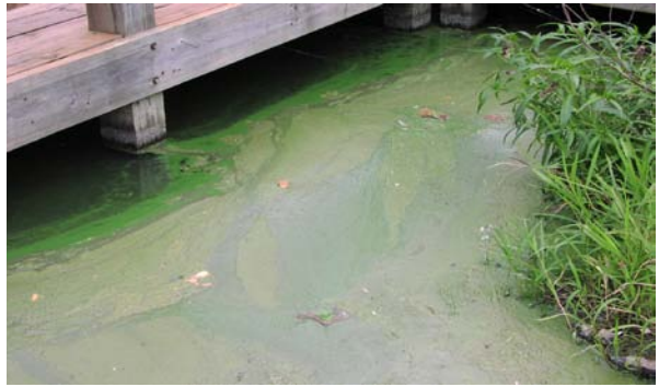
Central Park Lake Blue-green Bloom