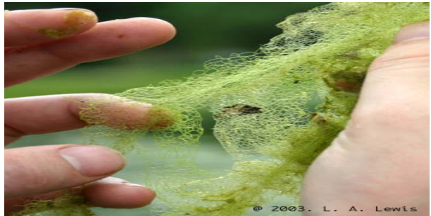
Hydrodictyon reticulatum - common name "water net"