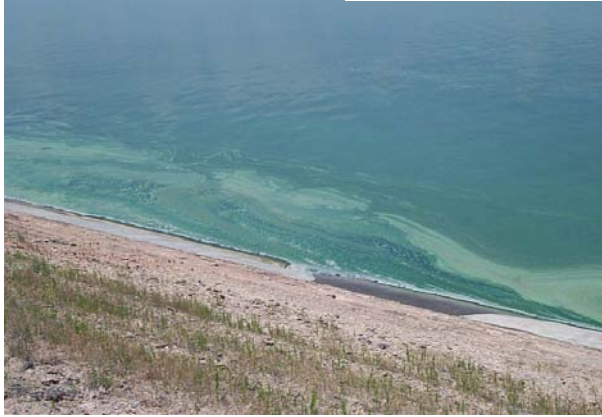
Cheney Lake Microcystis & Anabaena Bloom