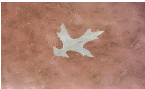
Weatherby Lake Planktothrix bloom in ice