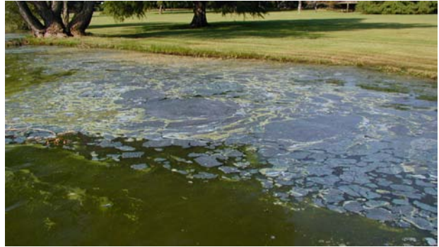
Lake Vaquero Microcystis Blooms with phycocyanin