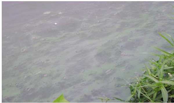
Central Park Lake Microcystis Bloom