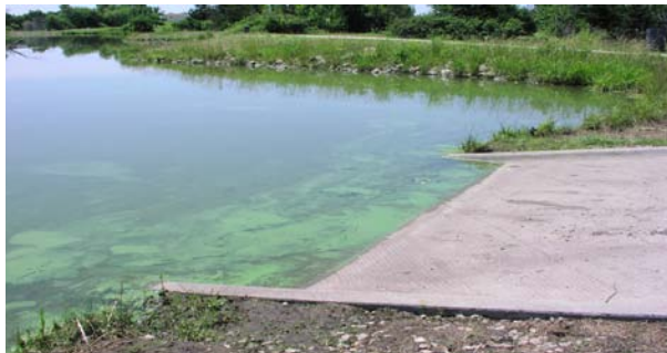
Overbrook City Lake Microcystis Bloom