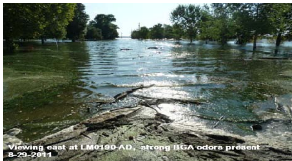
Viewing east at LM0190-AD, strong BGA odors present 8-29-2011