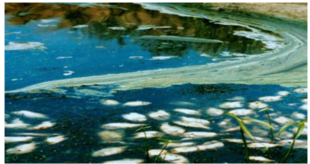
Blue-green bloom and fishkill