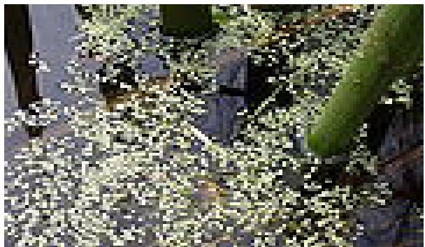
Lemna Minor - Duckweed