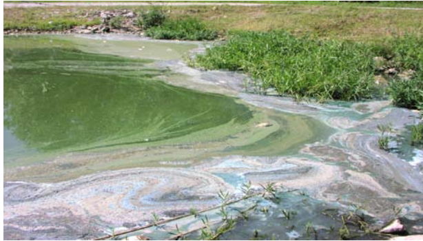
Miami Co. SFL Microcystis Blooms with phycocyanin