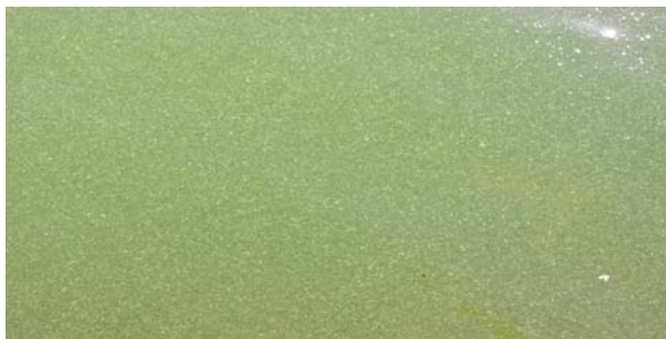
Lake Tanko Microcystis Bloom