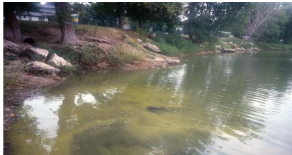
Rimrock Park Lake Coelosphaerium