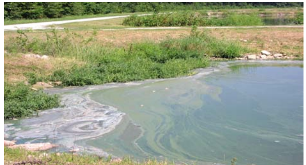
Miami Co. SFL Microcystis Blooms with phycocyanin