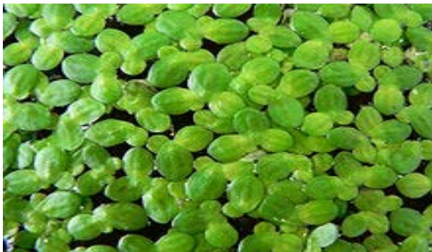
Lemna - Duckweed