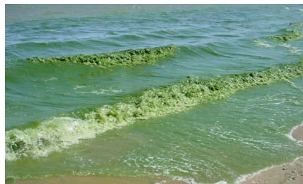
Marion Lake bloom (mostly Anabaena blue-greens)