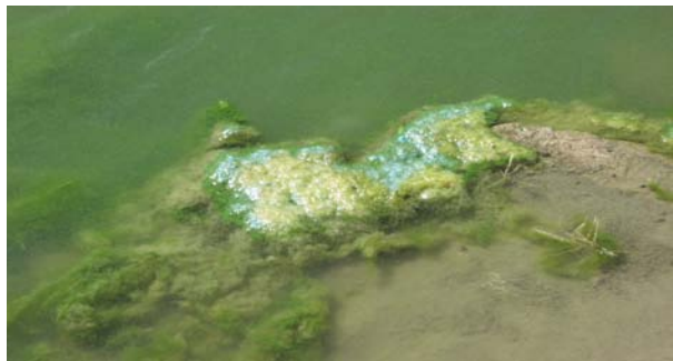
Lake Charles Phycocyanin pools as blue-greens die