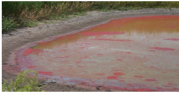
Blue-green bloom with Euglena sp. bloom on surface Smith Co. Tail Water Pit