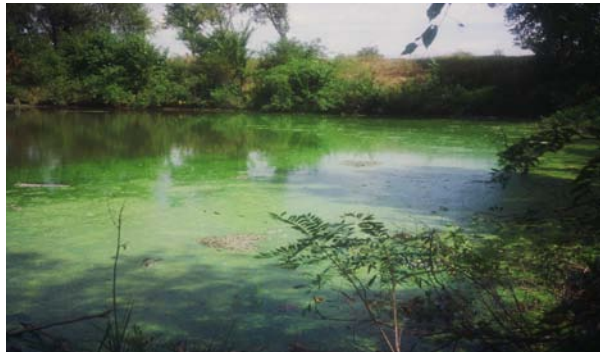
Myers Lake Mixed Bloom