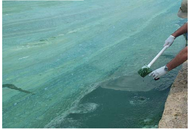
Cheney Lake Microcystis & Anabaena Sampling