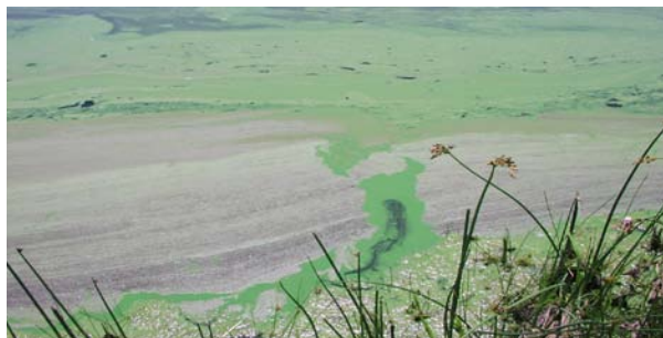
Overbrook City Lake Microcystis Bloom