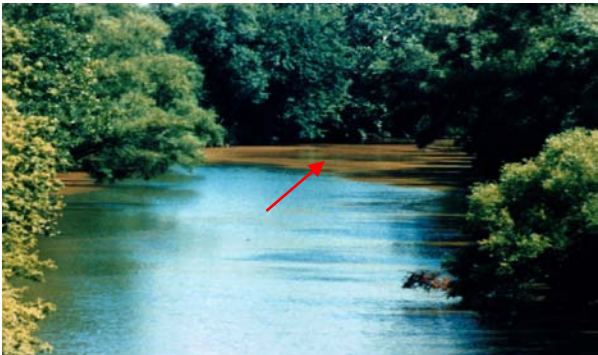
Lyon Creek Euglena Bloom