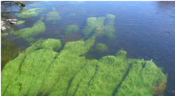
Filamentous Green Algae Mat