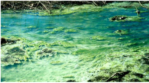
Filamentous green algae in stream