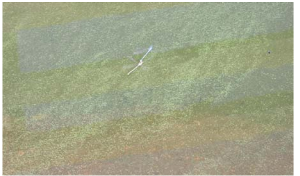
Central Park Lake Microcystis Bloom