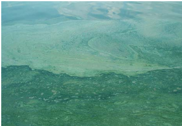
Cheney Lake Microcystis & Anabaena Bloom